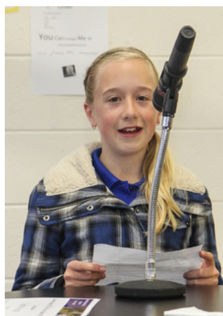
2012 11& Under Reps Speech

We are lucky to still have her around STNA as a Player, Coach and Mentor!