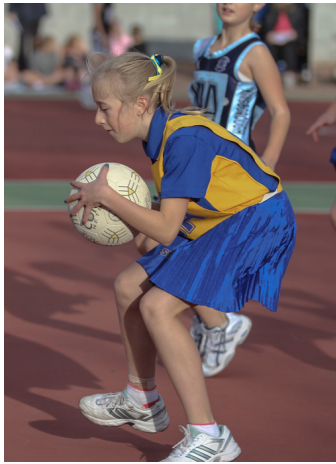
2012 11& Under Reps